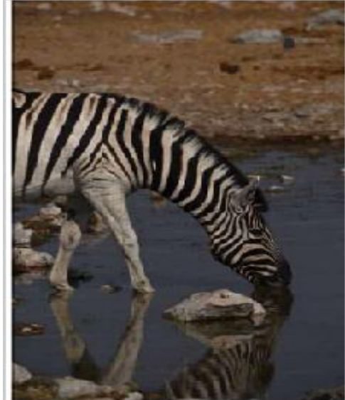
Fig.5 Image obtained after decomposition