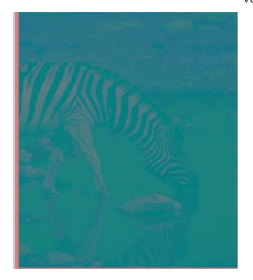
Fig.4 output after combining R,Cb,Cr components