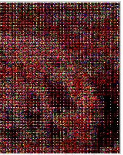
Fig.3 Image after sub-band decomposition