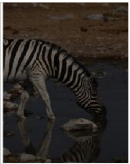
Fig.2 Input Image